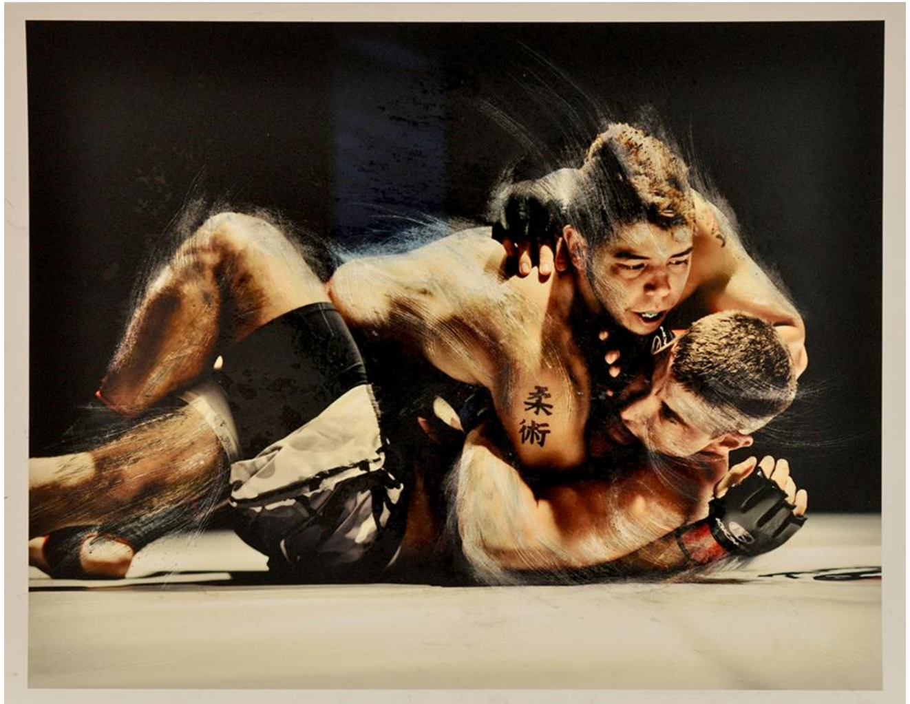
Sublimation II Archival Inkjet Print and Ink (One-of-a-Kind) 21 ½" x 17" $300.00