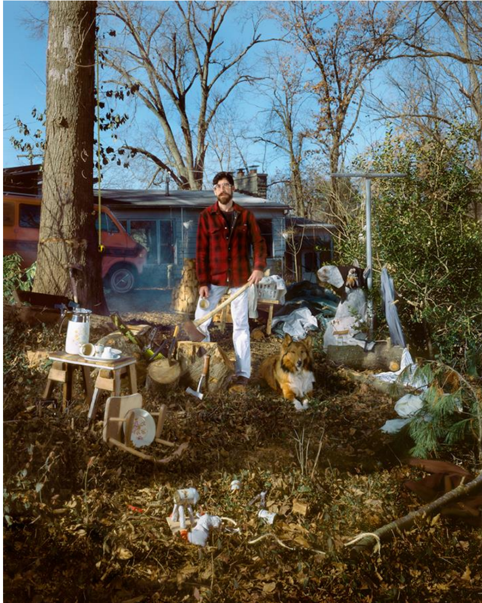
One More Swing

Archival Inkjet Print (Edition of 5: 4 Available) 41" x 61"