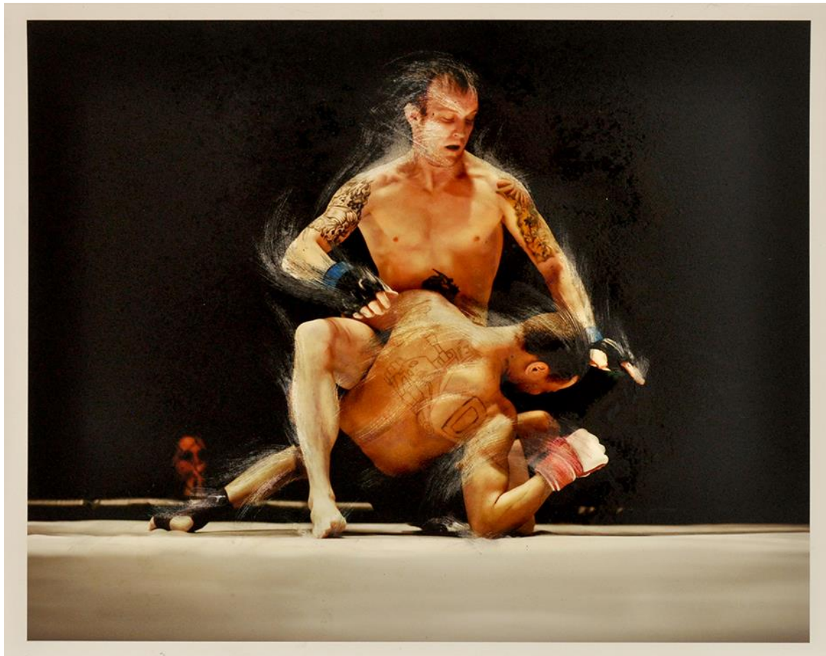
Sublimation III Archival Inkjet Print and Ink (One-of-a-Kind) 22" x 17" $300.00