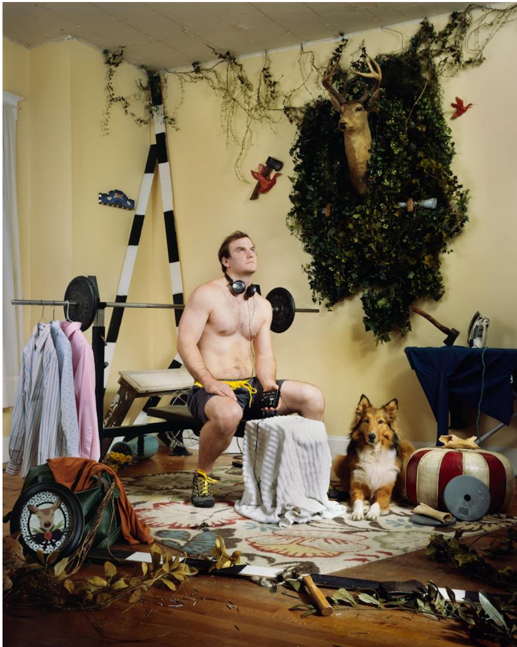
Ivy Deer Dog Room

Archival Inkjet Print (Edition of 5) 41" x 61"